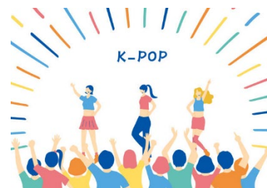
FUN & RICH CULTURAL EXPERIENCE